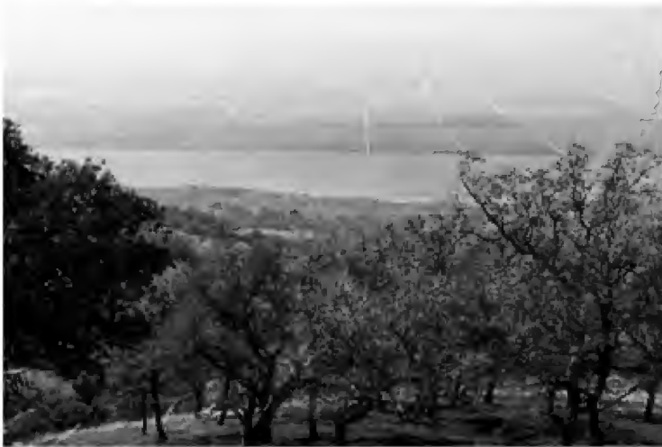
San Joaquin Valley from White Wolf.